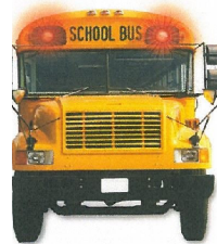
SCHOOL BUSES WITH OVERHEAD Red Lights (With or Without Bus Stop Signs)