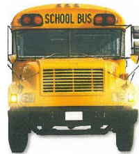
ALL SCHOOL BUSES Yellow Lights