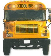
SCHOOL BUSES WITH OVERHEAD Red and Yellow Lights (With or Without Bus Stop Signs)