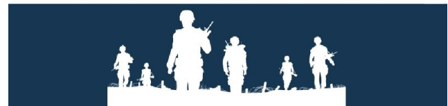
APPROXIMATE NUMBER OF VETERANS BY STATE*