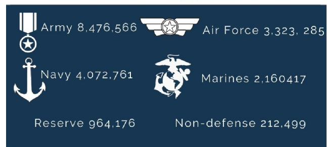
APPROXIMATE NUMBER OF LIVING VETERANS HAVING SERVED IN PAST WARS